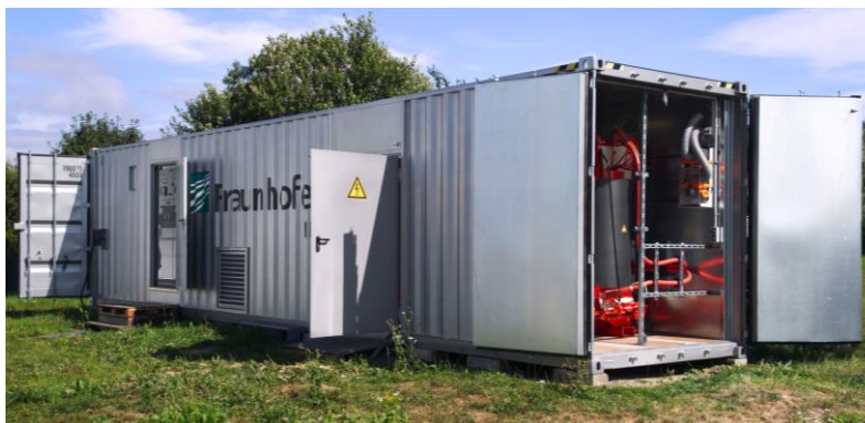
Mobile OVRT test system in a 40-foot sea container