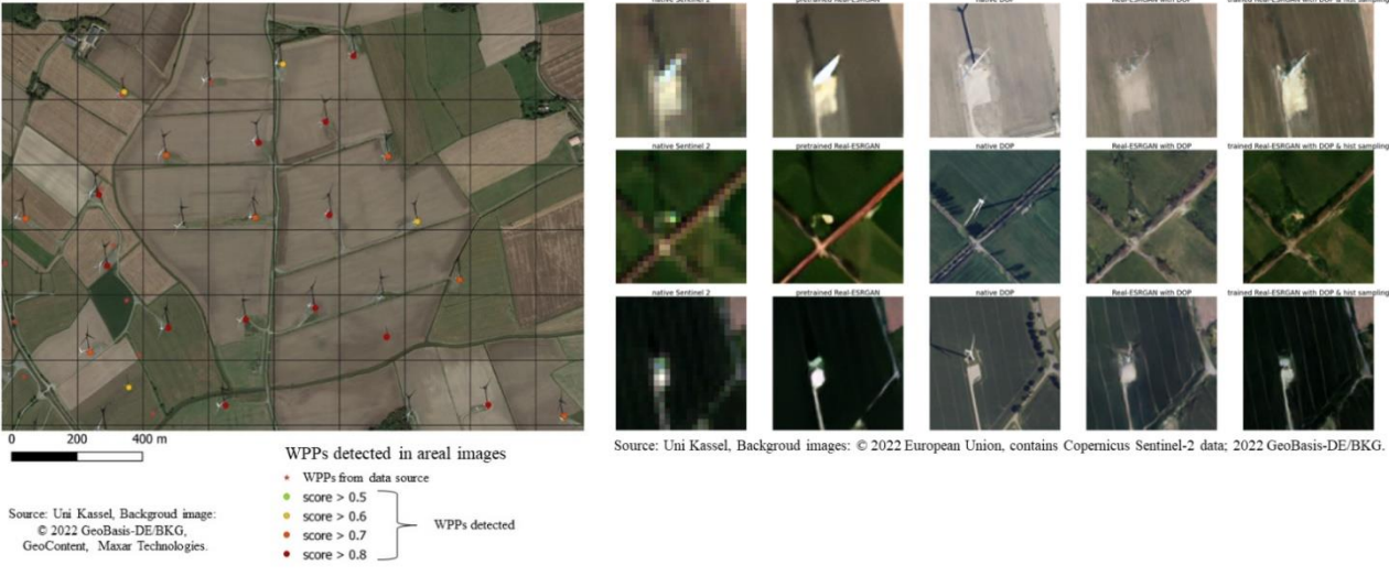
Figure 1: Preliminary result of satellite imagery detection (WG and PV)

Kassel University in collaboration with CSIR have succeeded to develop freely accessible tools to detect installed wind energy and photovoltaic systems in EU and AU countries using satellite imagery, digital orthophotos, and machine learning approaches. The generated data and other project's data and tools are adopted to demonstrate six energy case studies in EU and AU. Typical preliminary results are shown in the figure based on a very high-resolution aerial imagery. The results of the applications will subsequently be used for resource assessment as well as to support the spatial distribution of new wind and PV installations and the generation of various time series. Results will be published in an appropriate form during the year.